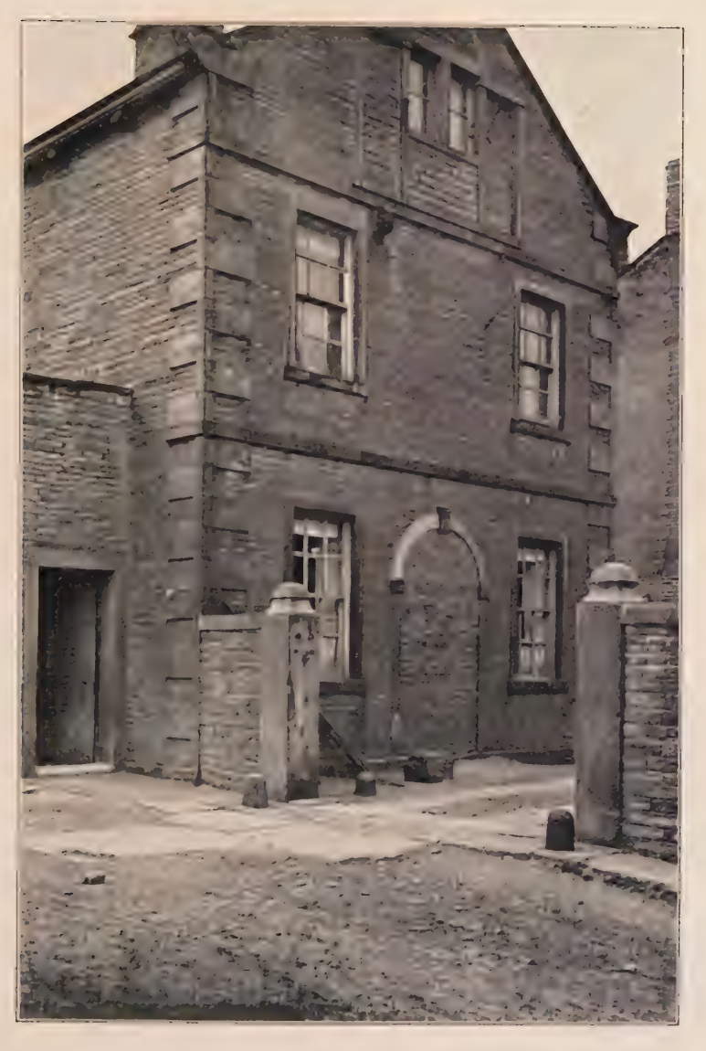
LAW HILL—OUTBUILDING (WUTHERING HEIGHTS) Door built up, said to be the old door of schoolroom